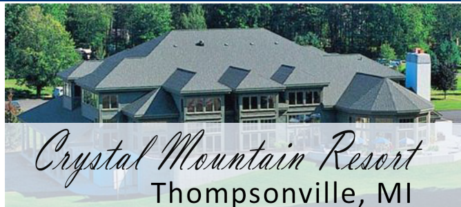
Crystal Mountain Resort Thompsonville, MI